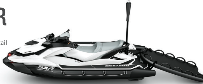
Rescue Sled Optional, sold separately

When you're on a rescue mission, every detail counts. The all-new Sea-Doo® Search and Rescue (SAR) watercraft seamlessly combines the features you need to respond to life threatening situations. It is designed for breathtaking rescue performances, from surf and white water, to flood and other emergency situations. The Sea-Doo SAR excels in rescue missions but is also ideal for evacuation, surveillance and interception. The SAR watercraft truly goes the extra mile. Because when lives are hanging in the balance, every detail counts.